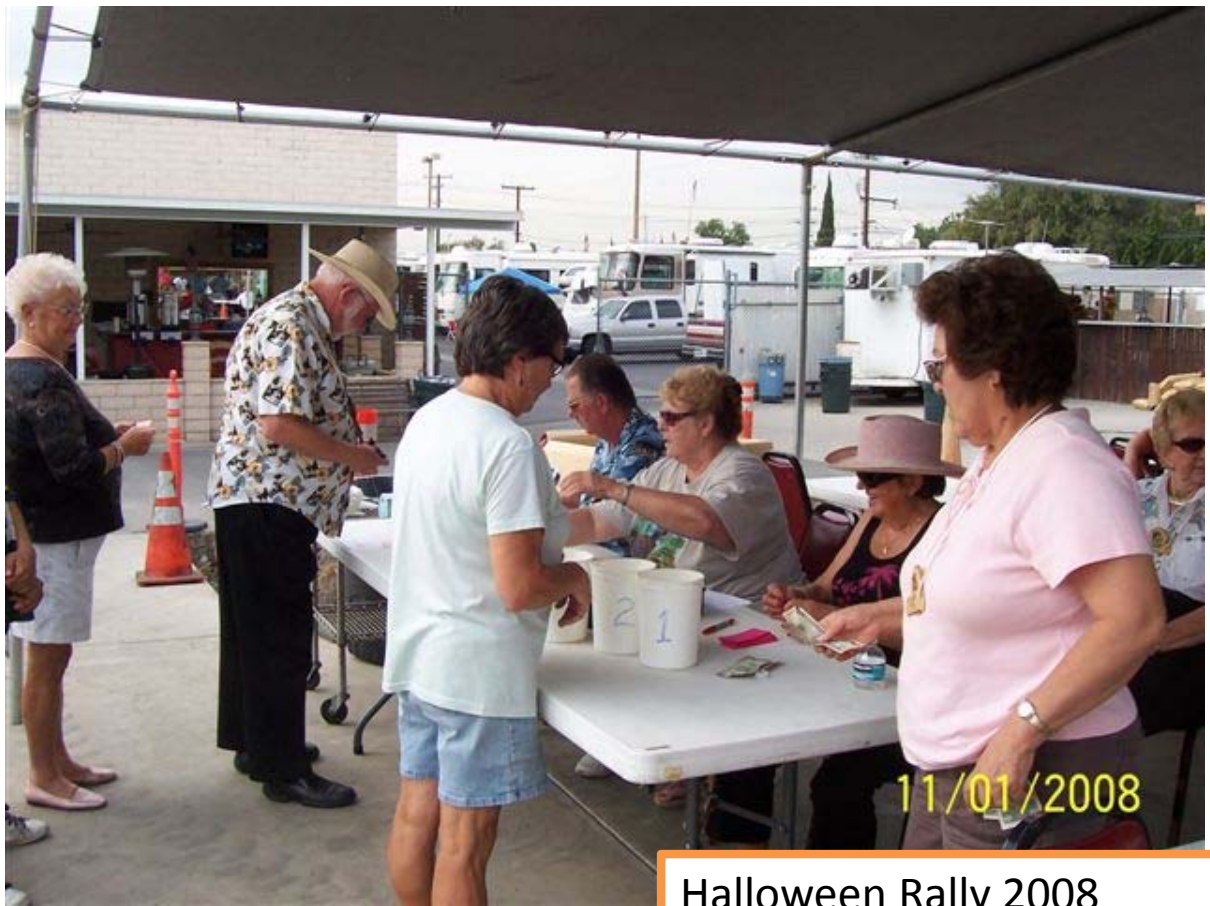
Halloween Rally 2008