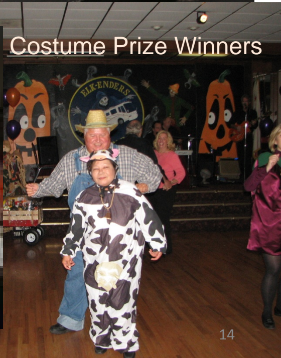
Costume Prize Winners