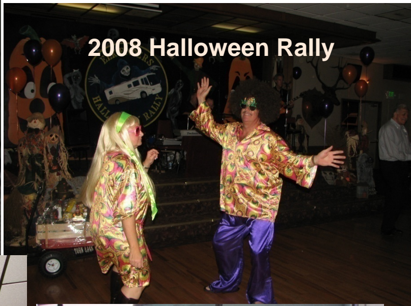
2008 Halloween Rally